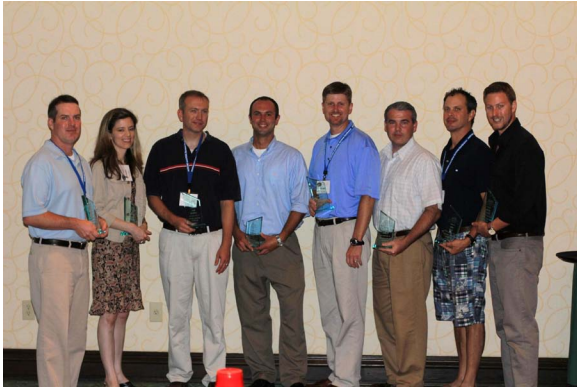
ABOVE: ACEC/NC's 2011 Future Leaders Class

This year, ACEC/NC teamed up with PENC for its Summer Conference in Myrtle Beach, SC. From August 11th to 13th, ACEC/NC and PENC members attended great sessions during the day, and participated in outings and events in the evenings. On Thursday, August 11th, attendees got to sing and laugh at Crocodile Rocks, Myrtle Beach's piano bar. At dinner on Friday, August 12th, ACEC/NC was proud to see its Class of 2011 Future Leaders graduate (pictured below left). After dinner, attendees cheered on their friends, peers and children as many of them competed in "Minute to Win It" games (pictured below right). Following Saturday's sessions, staff held a "fond farewell" reception, and then it was time to prepare to head home. Everyone had a great time while soaking in important information...and hopefully soaking up some sun! We hope to see you all next year for our Summer Conference in Wrightsville Beach!